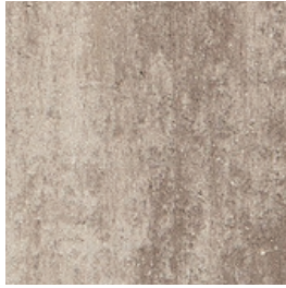
Enlighten - NEW