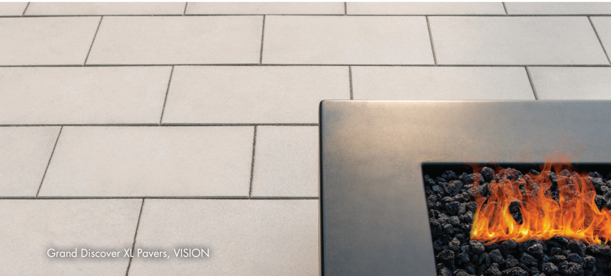
Grand Discover XL Pavers, VISION