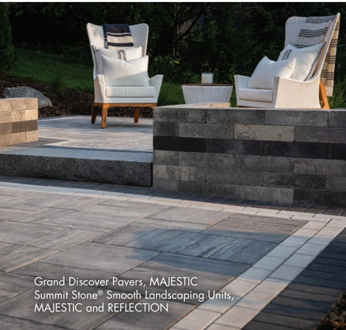
Grand Discover Pavers, MAJESTIC Summit Stone® Smooth Landscaping Units, MAJESTIC and REFLECTION