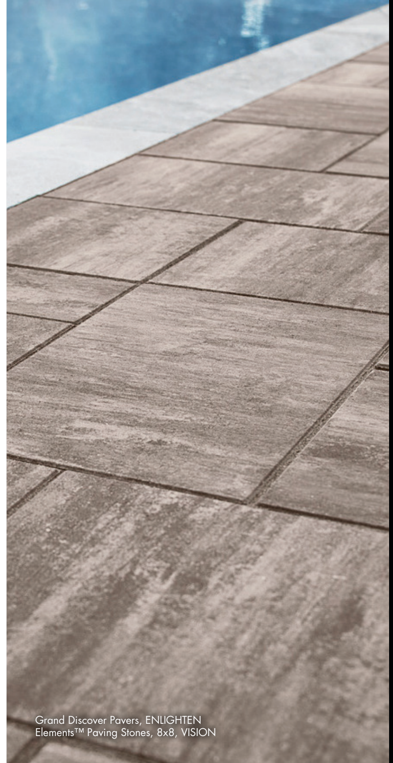
Grand Discover Pavers, ENLIGHTEN Elements™ Paving Stones, 8x8, VISION