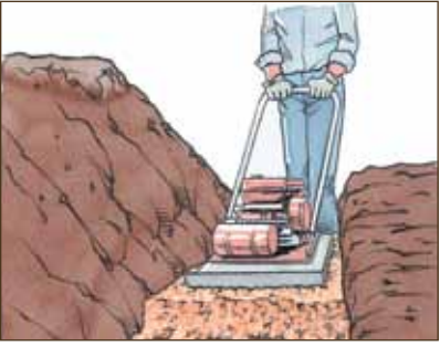
Diagram 2—Leveling Pad