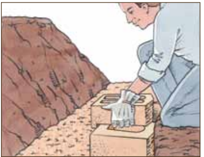
Diagram 3-Next-Course Construction