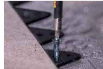
5/8" (15mm) height

For use on: GATOR TILE EDGE are use to support, stabilize and offer a strong lateral support for the perimeter of a porcelain tile installation for a patio, sidewalk, pool surrounding & terrace fasten to the Gator Base with the help of the Gator Base Screws.