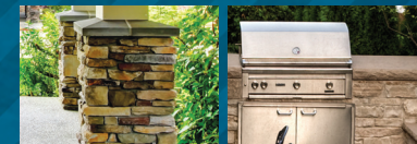
Dry Stack & Outdoor Kitchens