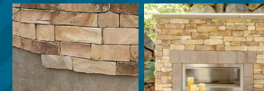
Veneer & Fireplaces